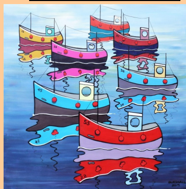
What no houses? Flotilla by Paul Bursnall - A winner