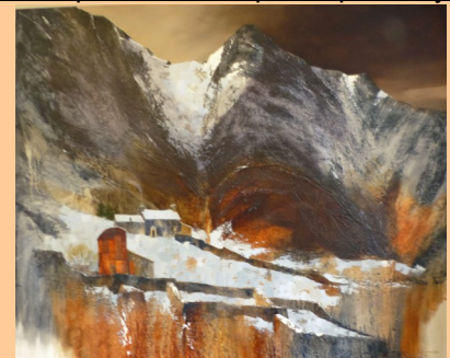
1 m x 1.20