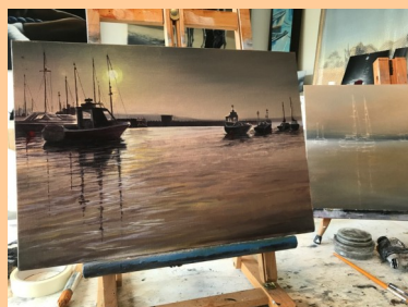
Fresh off the Easel